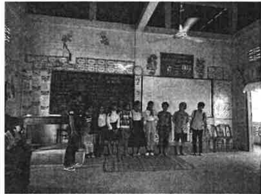
The activity of final ceremony at Kompong Chnang province