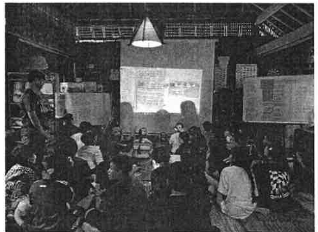
Group3: Video showing about Education