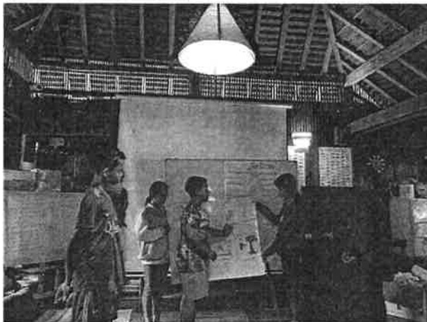
Group2: Drawing about environment And discrimination toward behavior