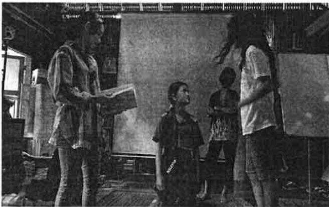
Group 1: Discrimination to the Vietnamese children at school

Group 3: children from Kompong Chnang province chose the issues of education by using video showing and they developed it during the peace camp.